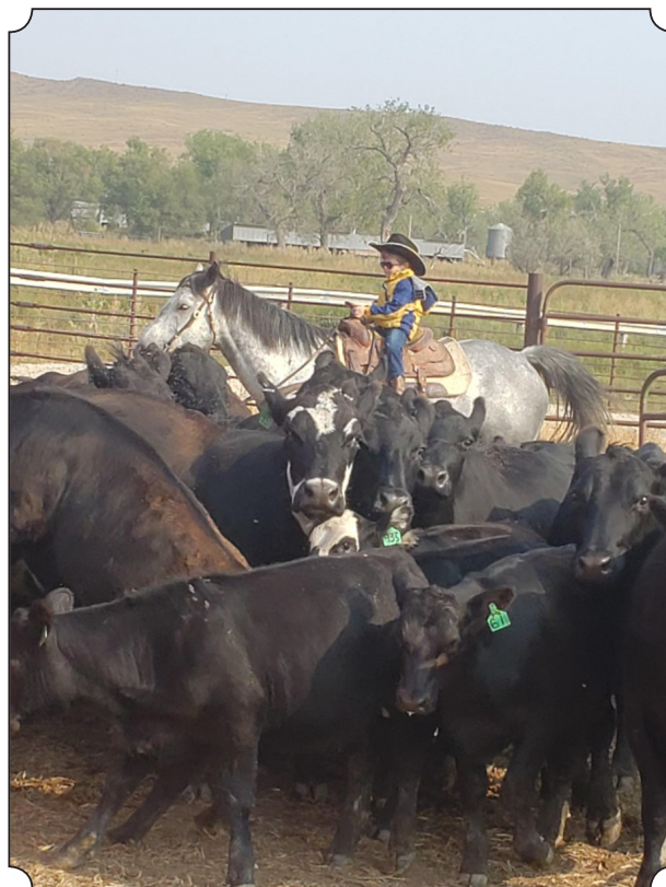
Dale and Eyore doing cowboy stuff